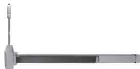
Less Bottom Rod